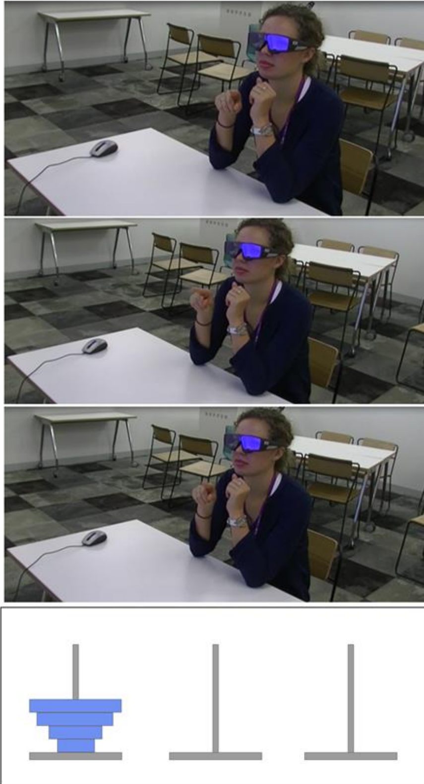
Figure 1. Example of gesturing during the mental solving phase (1 s per frame). To show where participants look at during gesturing, the last frame is an example of the static Tower of Hanoi presented for 60s during mental problem solving (inverted rules condition).